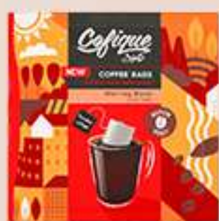
COFFEE BAGS MORNING