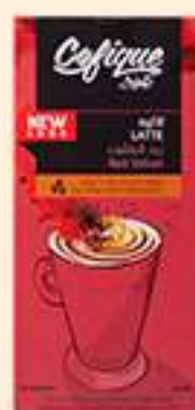
LATTE RED VELVET