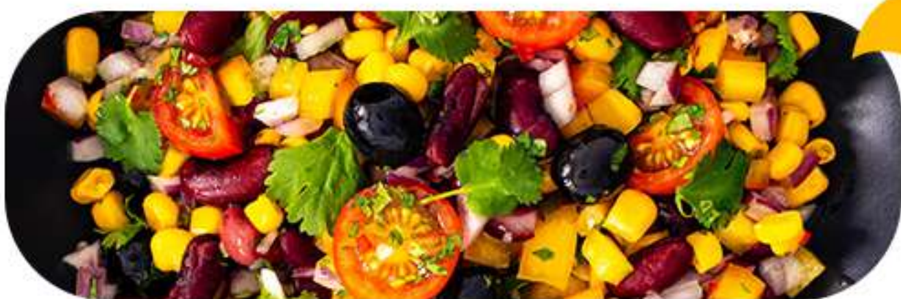
PROFESSIONAL VEG & FRUITS-CVF