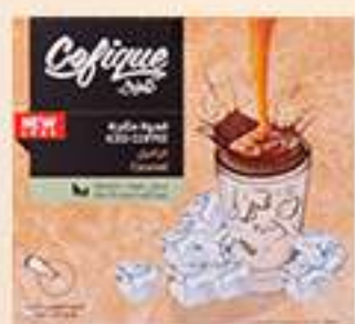
ICE COFFEE CARAMEL