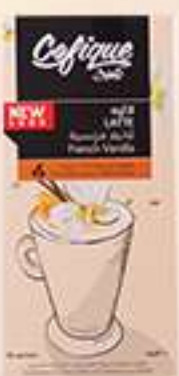
LATTE FRENCH VANILLA