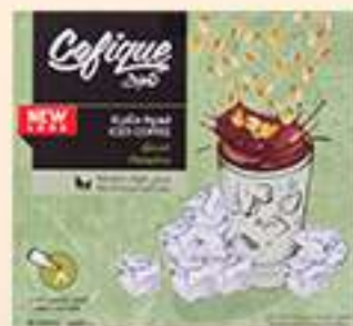
ICE COFFEE PISTACHIO