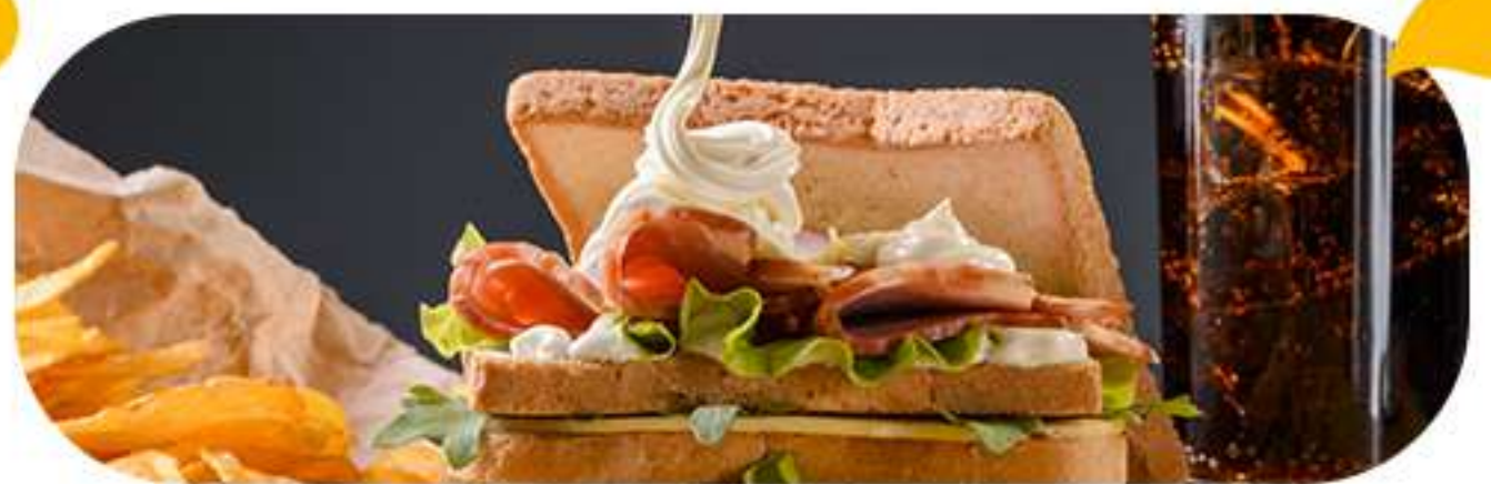
BACK OF HOUSE