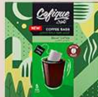
COFFEE BAGS DECAF