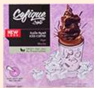
ICE COFFEE MOCHA