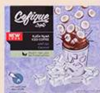
ICE COFFEE COCONUT