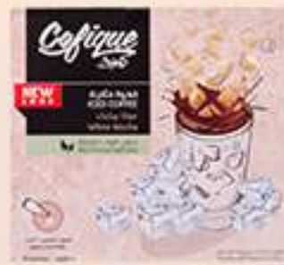
ICE COFFEE WHITE MOCHA