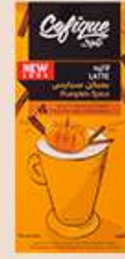
LATTE PUMPKIN SPICE