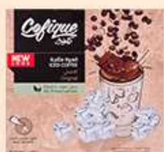
ICE COFFEE ORIGINAL