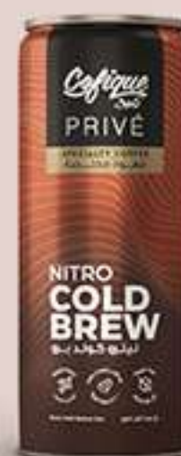
NITRO COLD BREW