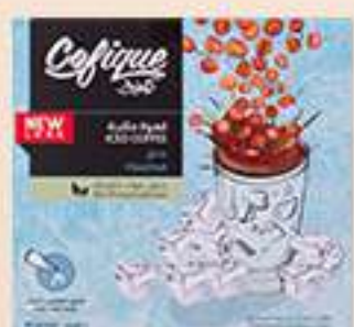
ICE COFFEE HAZELNUT