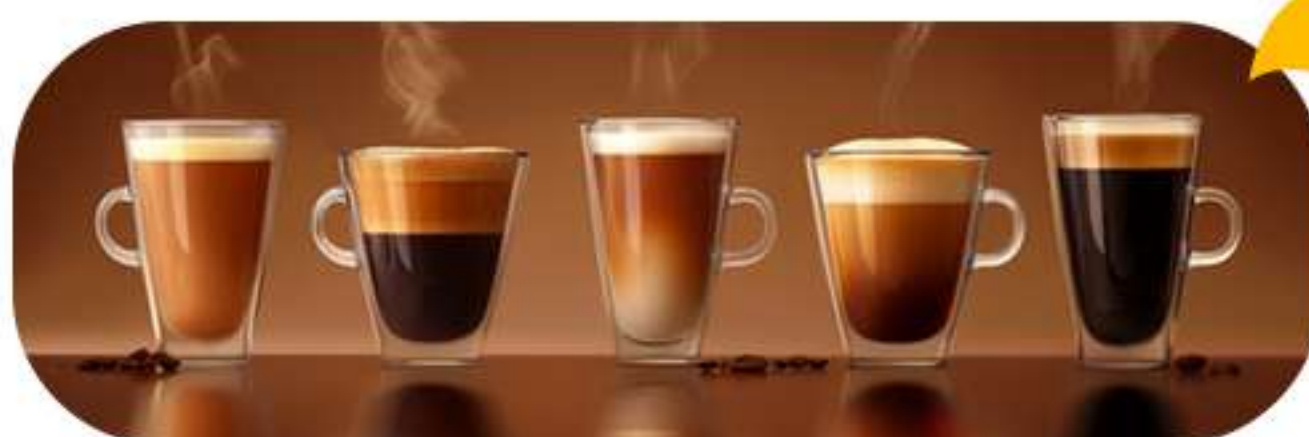
PROFESSIONAL COFFEE SOLUTIONS